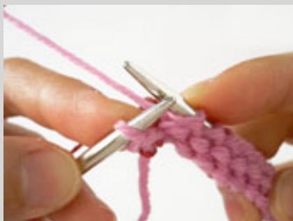
Figure 4. Bring yarn back as if to knit.