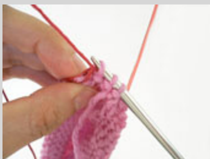
Figure 10. Unravel the crochet provisional cast on. Unravel from the free chain sts.