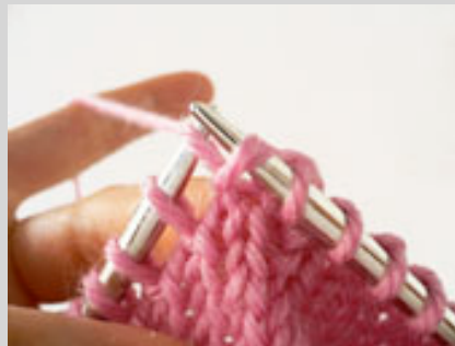
Figure 8. Scoop up the wrapped st and tog.