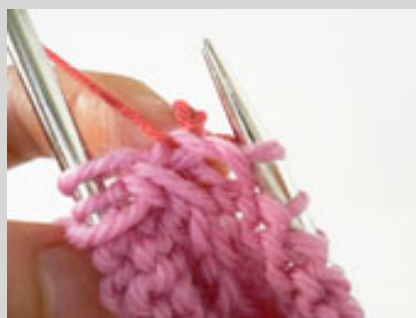
Figure 8. The last st does not look like an ordinary st. Make sure you don't miss it or you will have 51 sts instead of actual 52 sts.