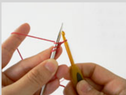
Figure 1. Crochet cast on with waste yarn. Leave few chain sts after making 26 sts so that you know where to unravel from.