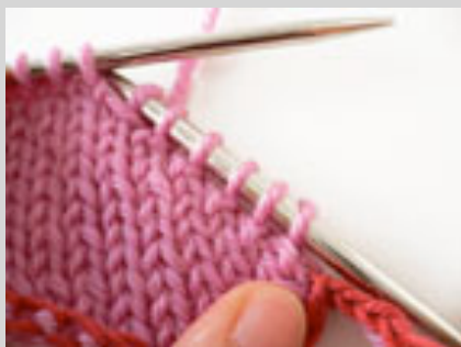
Figure 7. Repeat rows 5 and 6. The piece will have a slope like above.