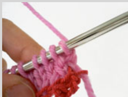
Figure 5. After the turn. The last st has the working yarn wrapped around it.