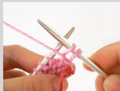
Figure 6. After the turn. The last two sts has the working yarn wrapped around them.