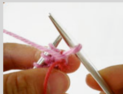
Figure 3. After the turn. The last st has the working yarn wrapped around it.