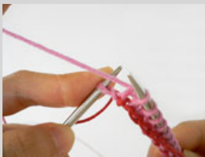
Figure 2. Bring yarn in front as if to purl.